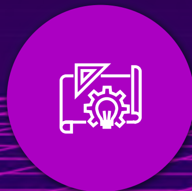
TP School of Engineering