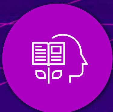
TP School of Humanities & Social Sciences