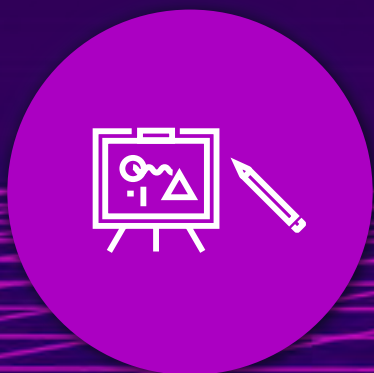
TP School of Design