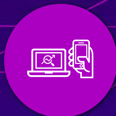
TP School of Informatics & IT