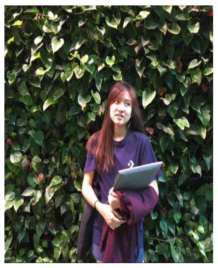
"I love hongkong vibes, it's damn cool."