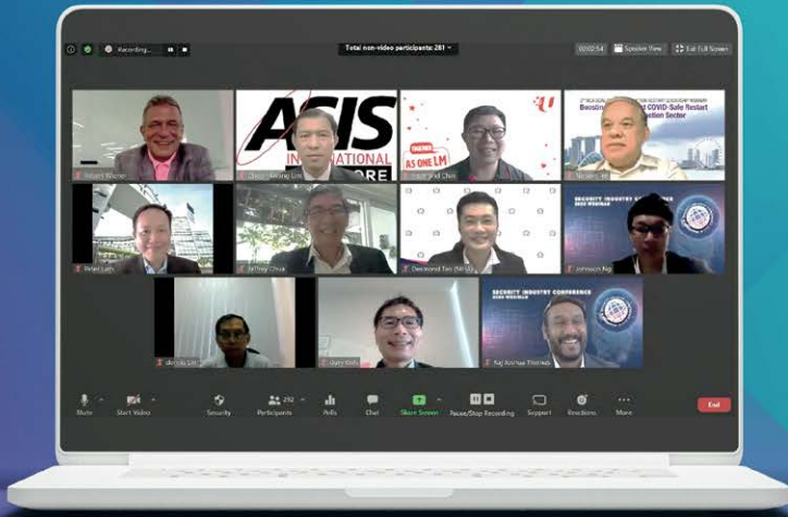
VVIP SIC 2020

Like its previous iterations, the 11 th annual Security Industry Conference (SIC) was a time of information exchange, peer sharing, and trendspotting for professionals in the security industry. The only notable difference this time was that unlike the previous conferences, SIC 2020 was held virtually via Zoom on 1 September 2020, where about 400 participants learned about the latest developments in the security industry.